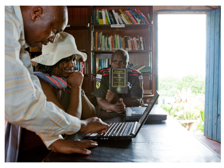
A community center in Magadi, Kenya, equipped with computers and internet access. Kenya is a pioneer in Africa in providing digital financial services.

A farmer in Kaduna meets staff from an agricultural investment firm providing smallholders with business knowledge, training, and soil analysis.