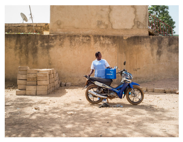
A "mobile midwife" prepares to visit a remote village in Burkina Faso to educate women there about local family planning services available to them.

Reduction in maternal mortality and stunting rates since 1990