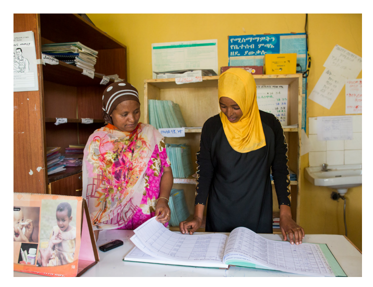
A health extension worker at a health post center near Mojo, Ethiopia. We support efforts to strengthen Ethiopia's primary health care system.